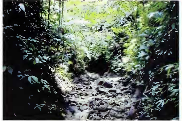
Fig. 4. Undisturbed riverine habitat upcountry of Salibabu Island. Habitat of Limnonectes sp. and an unidentified snake species.

forested. Surveys were done throughout all hours of day and early night. Specimens were mainly collected manually and with the assistance of a local villager. Voucher specimens were photographed prior to and after euthanization and preserved in 70 % ethanol. They are deposited in the Zoological Museum in Bogor (MZB). Tissue samples of monitor lizards were taken for molecular investigations and preserved in 95 % ethanol. Photographic vouchers are deposited in the private photo collections of AK and EA.